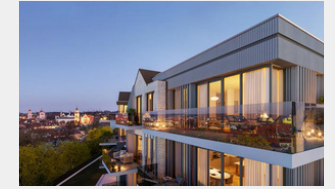
Vilos | Vilnius

Šaltiniu Namai| Attico – prestigious residential area in Vilnius