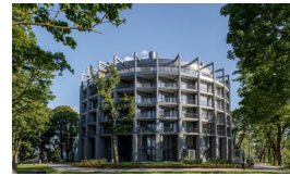
River Breeze Residence, Riga