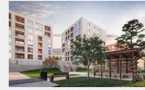
Kindrali Houses | Kristiine, Tallinn