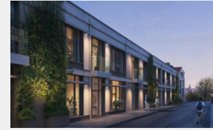
Attico Boutique | Vilnius