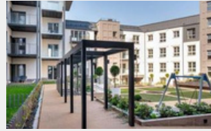
Šaltiniu Namai Attico | Vilnius