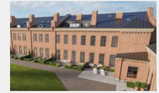
Dunte | Kristiine, Tallinn

Kristiine City – Kindrali Houses, Marsi 6, Ratsuri Houses, Kristina