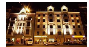
Pulkveža Brieža street 11/13, Riga